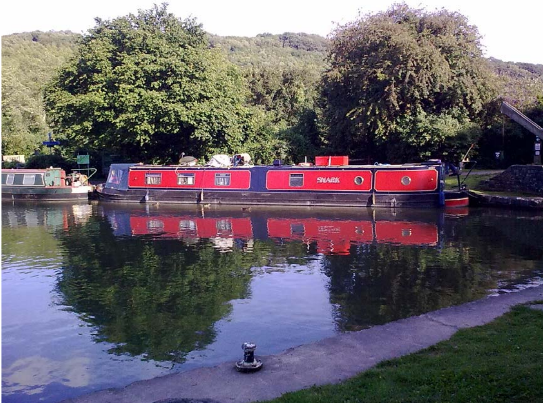
SNARK £62, 000 BOAT AND FITTINGS